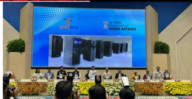
Release of NDEM 4.1 by the Honourable Union Minister of State for Home Affairs, Shri.NityanandRai, in 3 rd NPDRR on 11 March 2023